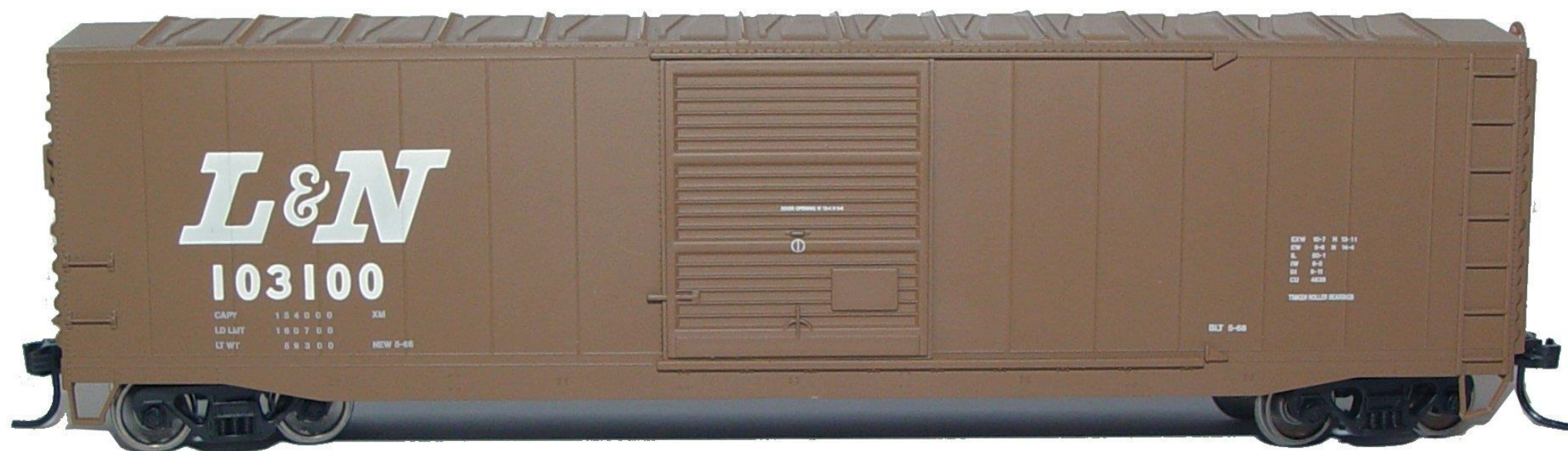
Louisville & Nashville: 50ft Boxcar with Sliding Door