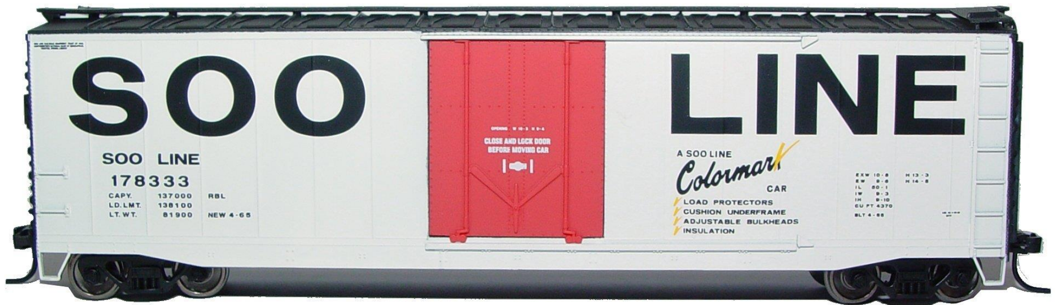
Soo Line: 50ft Boxcar with Plug Door and Roofwalk