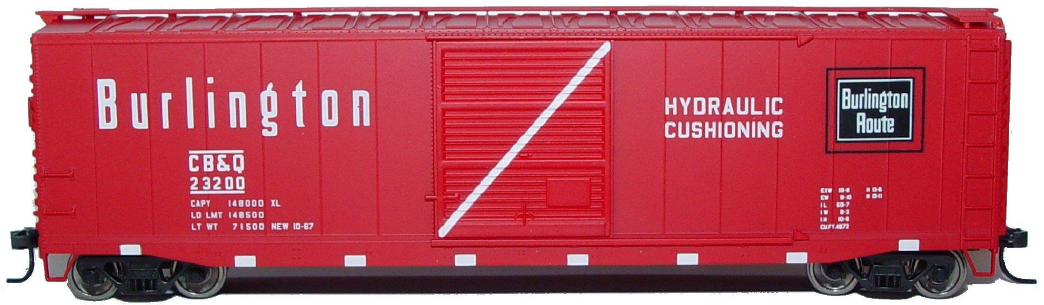
Chicago, Burlington & Quincy: 50ft Boxcar with Sliding Door and Roofwalk