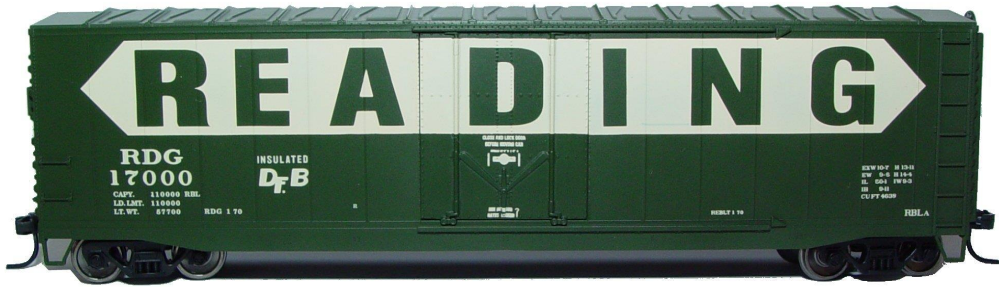
Reading: 50ft Boxcar with Plugdoor