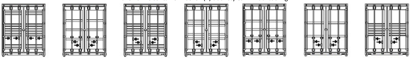
JTC 40' HC container – seven (7) door styles in initial tooling

JTC containers are lettered as per photographs, so variances will happen from any official lettering layout, as per photos. We do not use a generic layout, sometimes lettering layout from one company to another will be the same, or similar, and sometimes layouts will vary within the same company or scheme. Lettering Layouts can also vary with the door type within the same company.